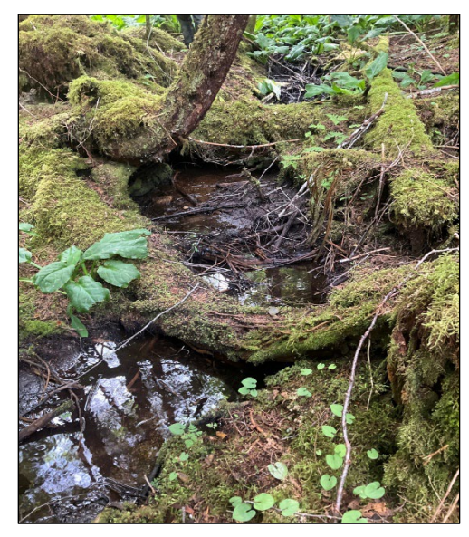
Figure 1. Upstream at waypoint 456.