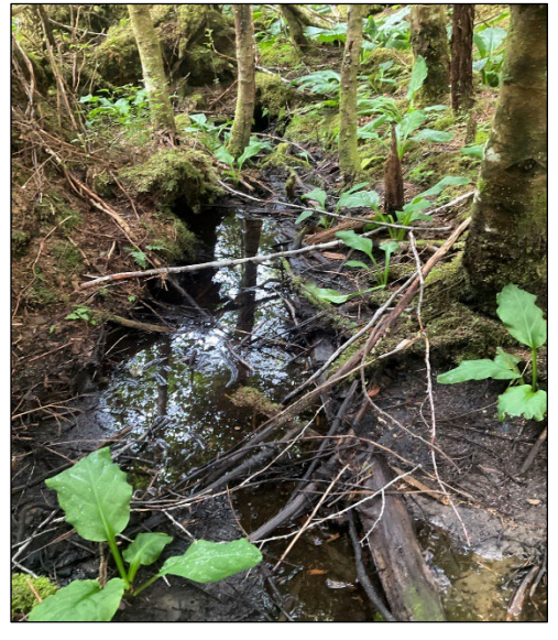
Figure 2. Downstream at waypoint 456.