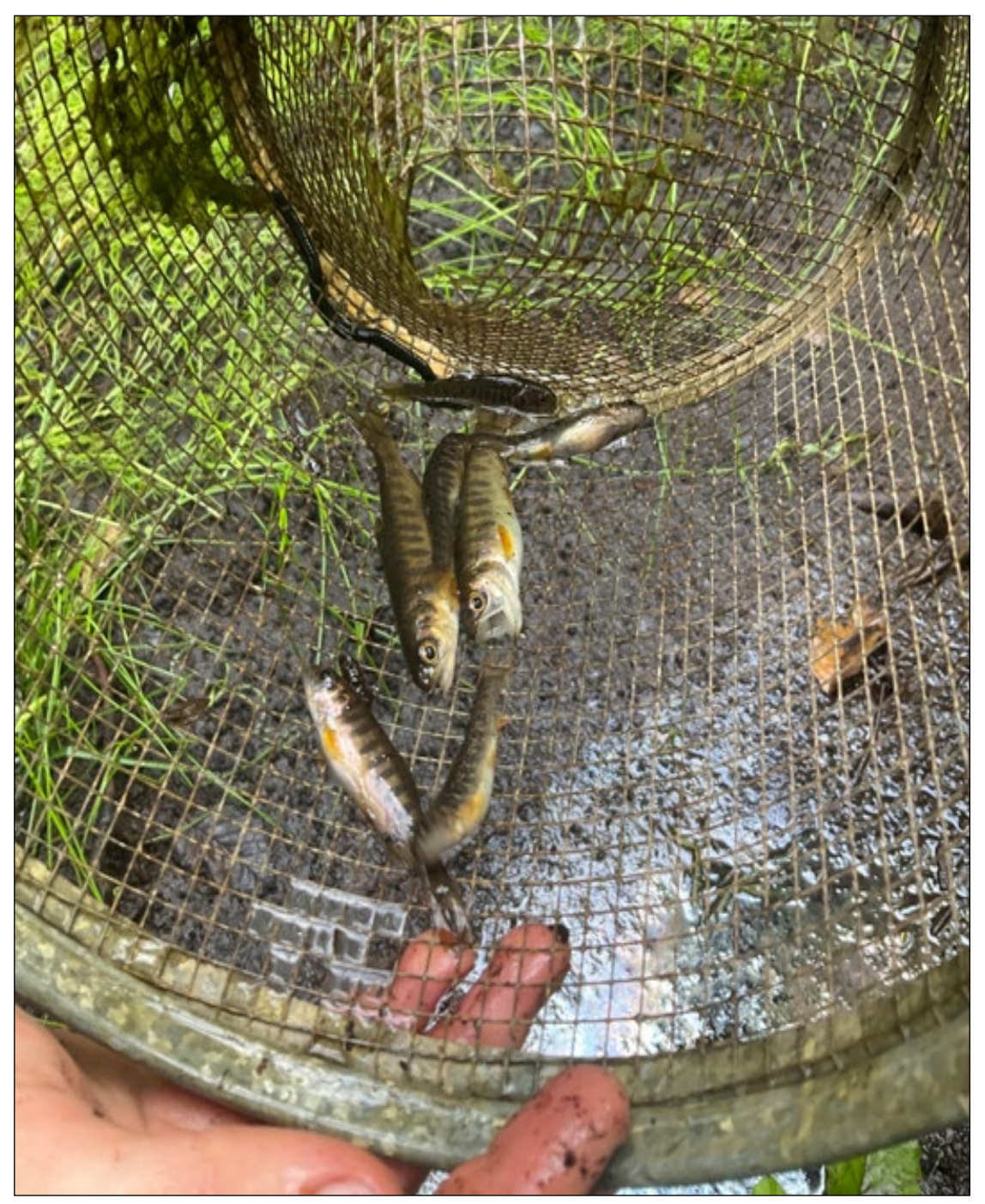
Figure 3. Juvenile coho salmon and Dolly Varden caught at waypoint 444.